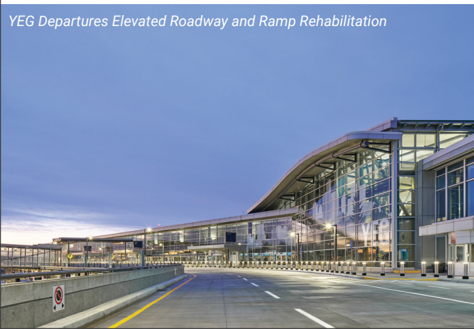
YEG Departures Elevated Roadway and Ramp Rehabilitation