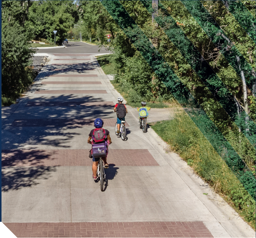
EDMONTON NEIGHBOURHOOD RENEWAL PROJECT – STRATHCONA

Creating confidence is at the core of everything we do.