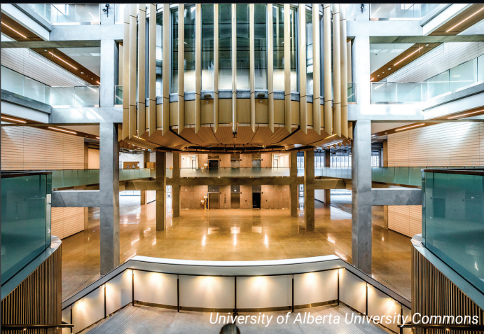
University of Alberta University Commons

Proud of Our Past... Building the Future